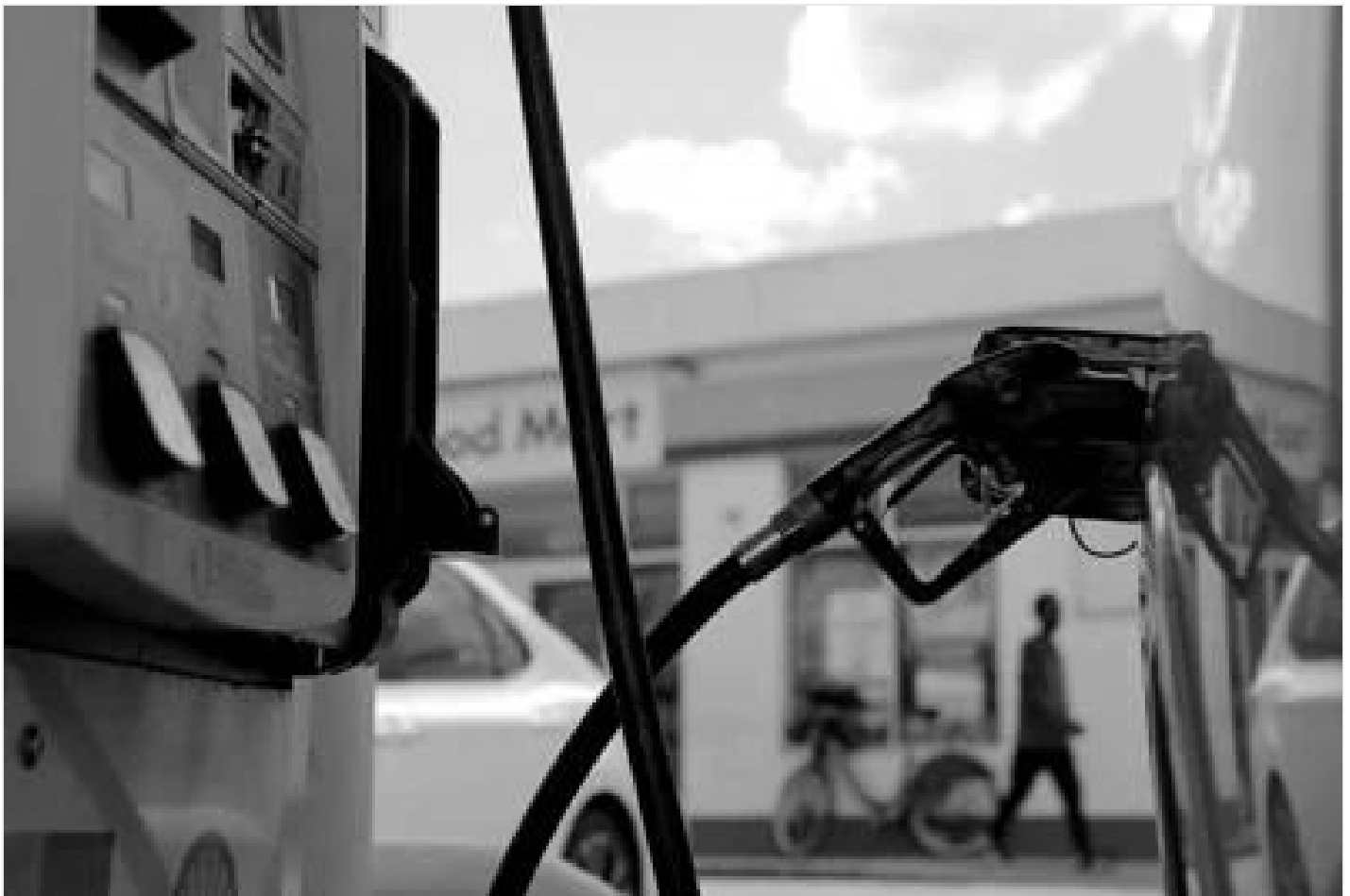
Colorado Springs gas prices fall for holiday week